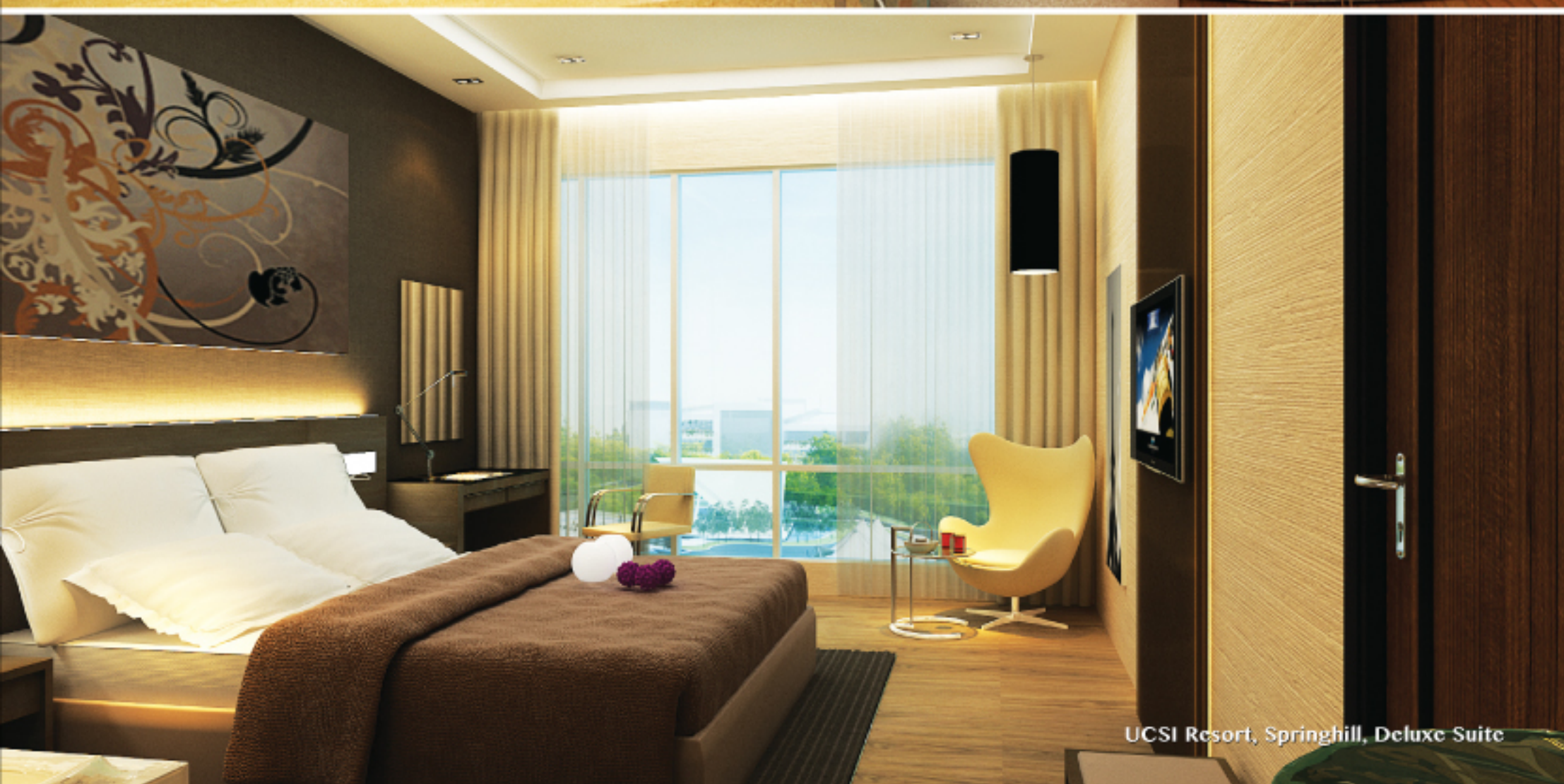
UCSI Resort, Springhill, Deluxe Suite

OUR MISSION: To offer unsurpassed service through the enhancement of space and unique solutions.