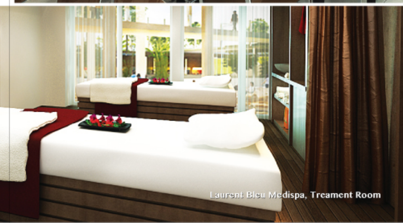
Laurent Bleu Medispa, Treatment Room

Our services involve Design Consultation and Design & Build services.