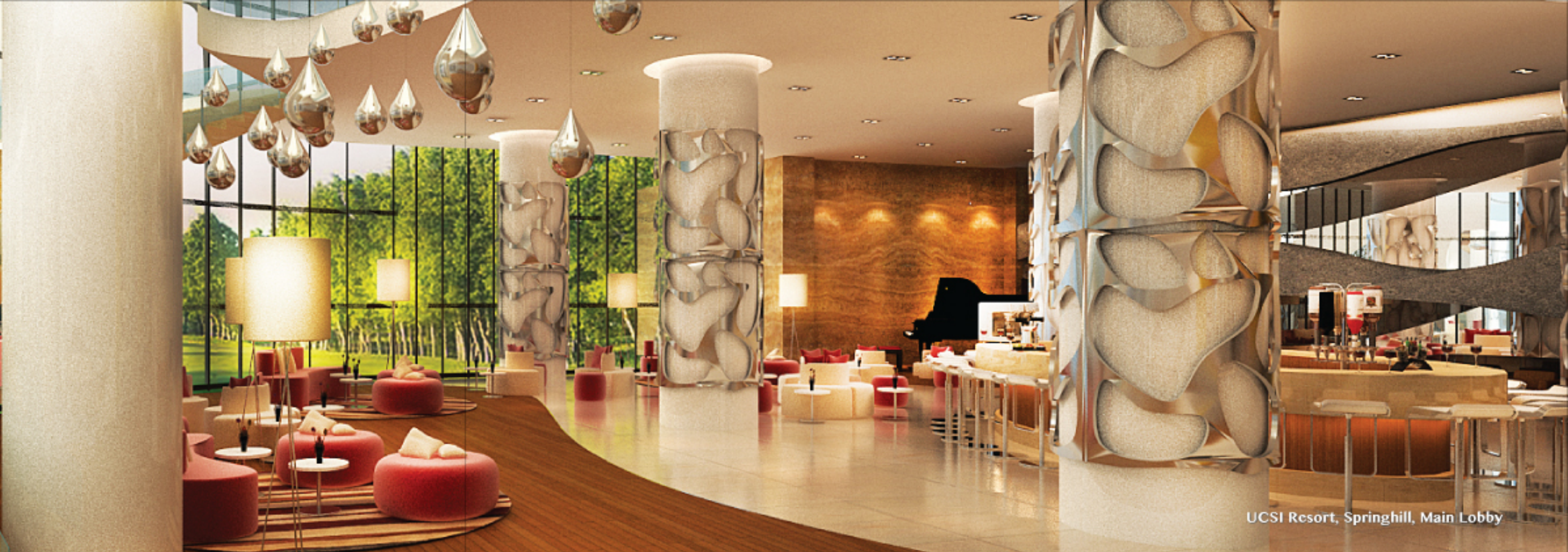
UCSI Resort, Springhill, Main Lobby