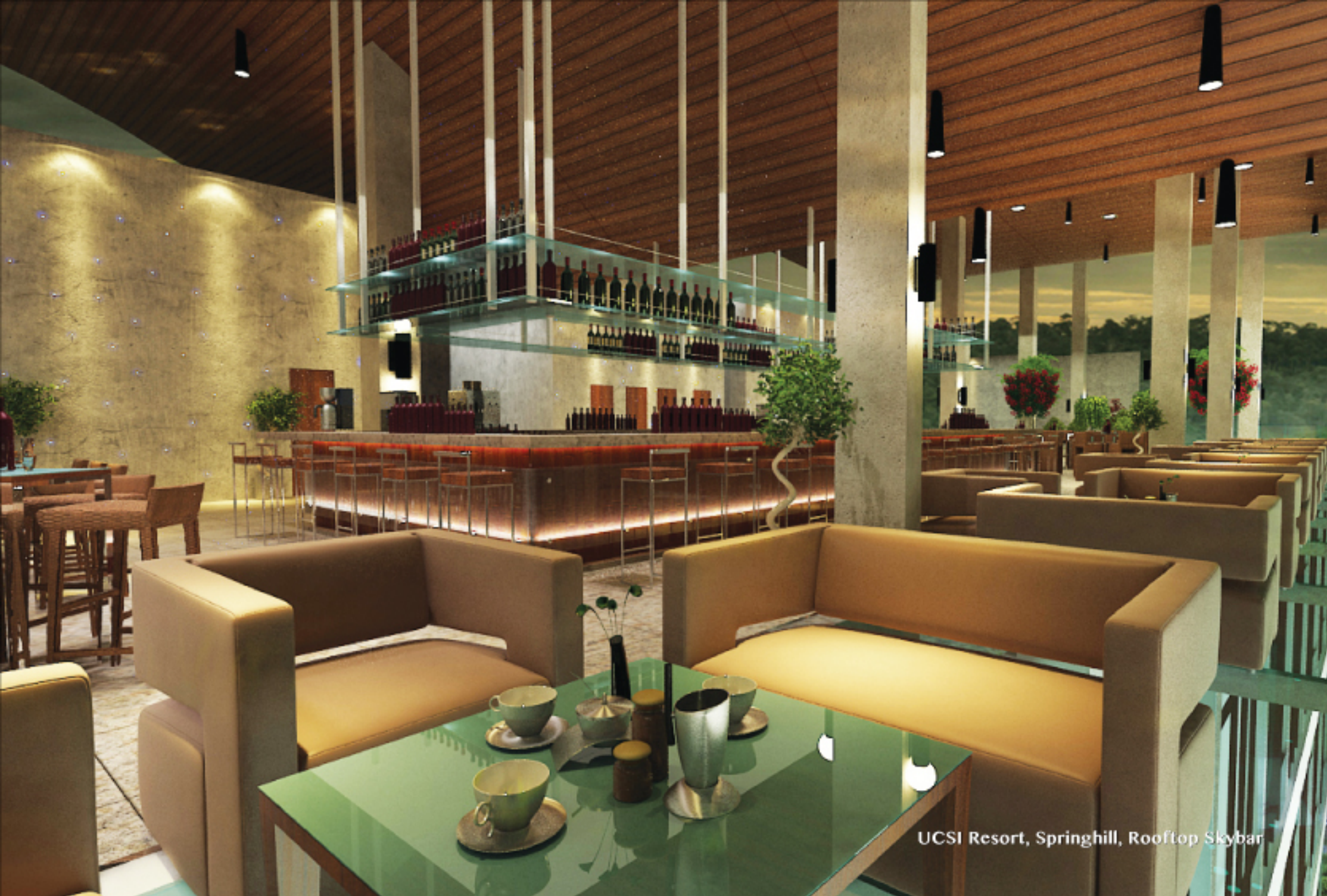
UCSI Resort, Springhill, Rooftop Skybar