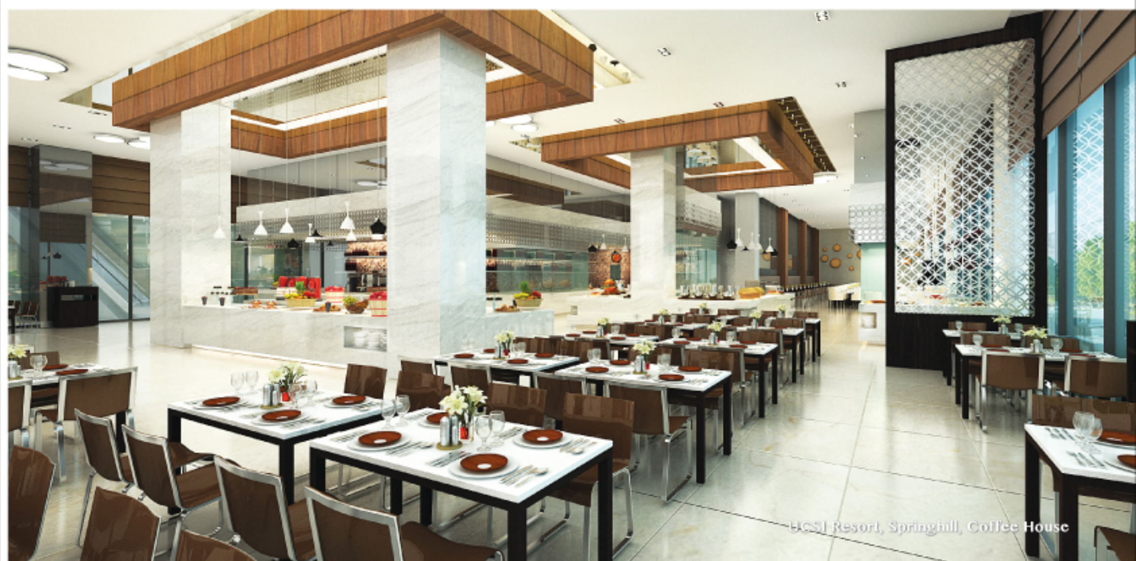
UCSI Resort, Springhill, Coffee House

OUR MISSION: To offer unsurpassed service through the enhancement of space and unique solutions.